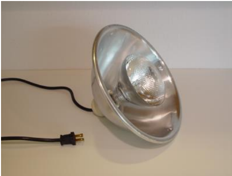
Non-conforming – exposed bulb