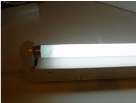
Non-conforming – exposed bulb