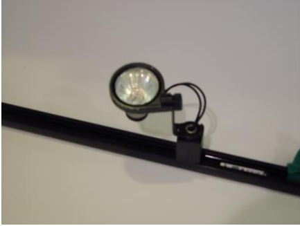
Conforming – low voltage “green”