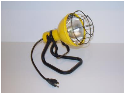
Conforming – cage over bulb

Below are a few examples of Conforming and Non-conforming