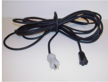
Conforming – 3 prong grounded