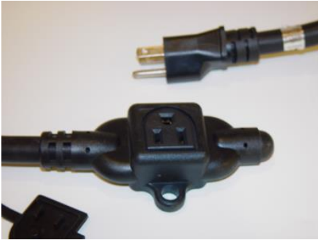
Conforming – 3 prong grounded