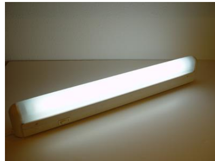
Conforming – covered florescent