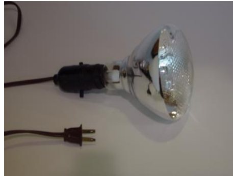
Non-conforming – exposed bulb