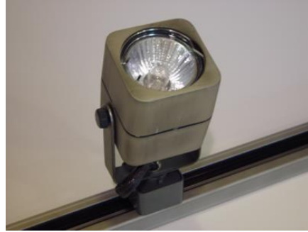
Conforming – low voltage “green”